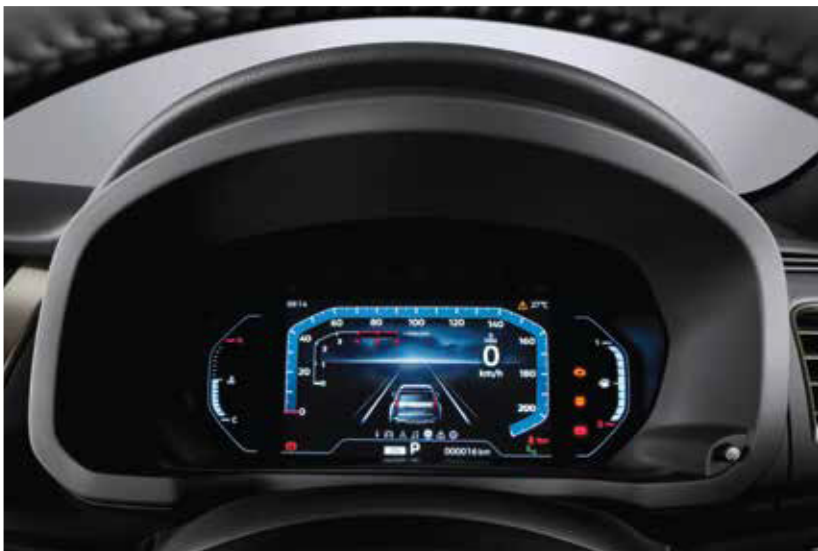
NEW 8 INCH DIGITAL DRIVER DISPLAY*

Redefining your driving experience with advanced technology.