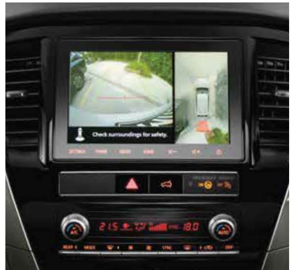
MULTI AROUND MONITOR*