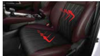
NEW SYNTHETIC LEATHER SEAT WITH HEAT GUARD 2