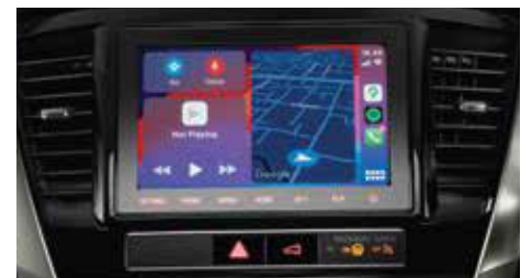
8 INCH SMARTPHONE-LINK DISPLAY AUDIO 3