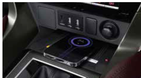
WIRELESS CHARGER 3