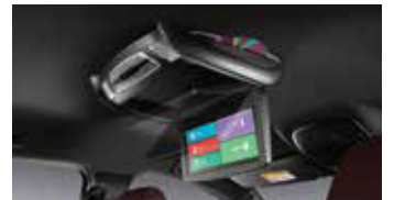
ENTERTAINMENT SYSTEM WITH ROOF MONITOR 5