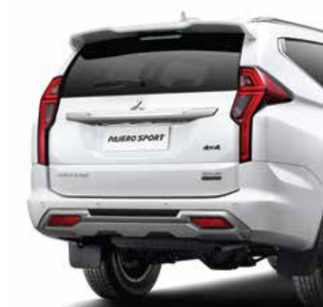
NEW REAR UNDER GARNISH