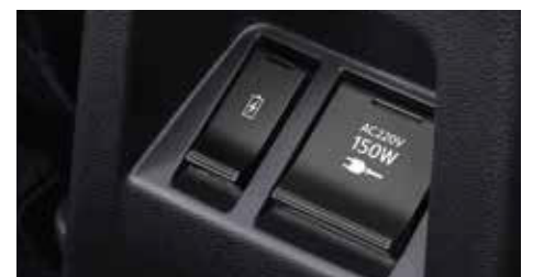
AC POWER OUTLET 220V/150W 2