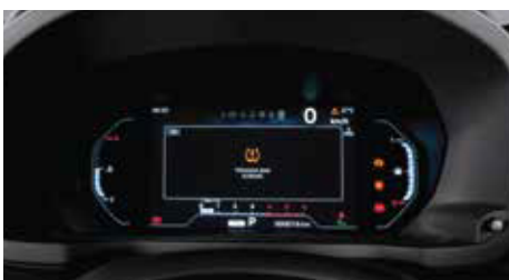
TIRE PRESSURE MONITORING SYSTEM (TPMS) 1