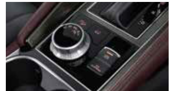
ELECTRIC PARKING BRAKE WITH BRAKE AUTO HOLD 3