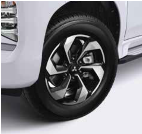
NEW 18 INCH ALLOY WHEEL DESIGN*