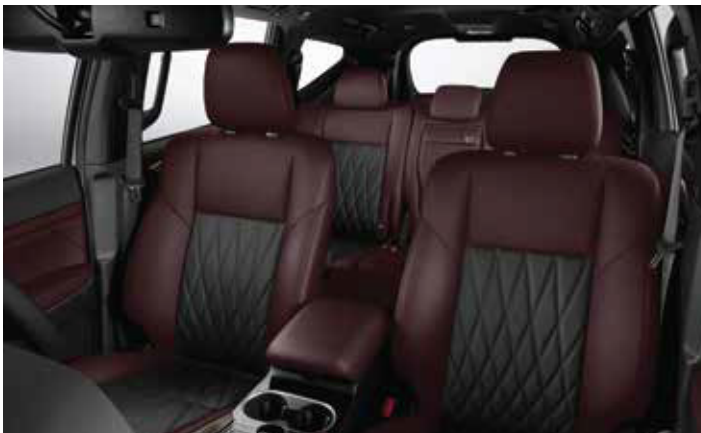
NEW BLACK AND BURGUNDY INTERIOR COLOR 2