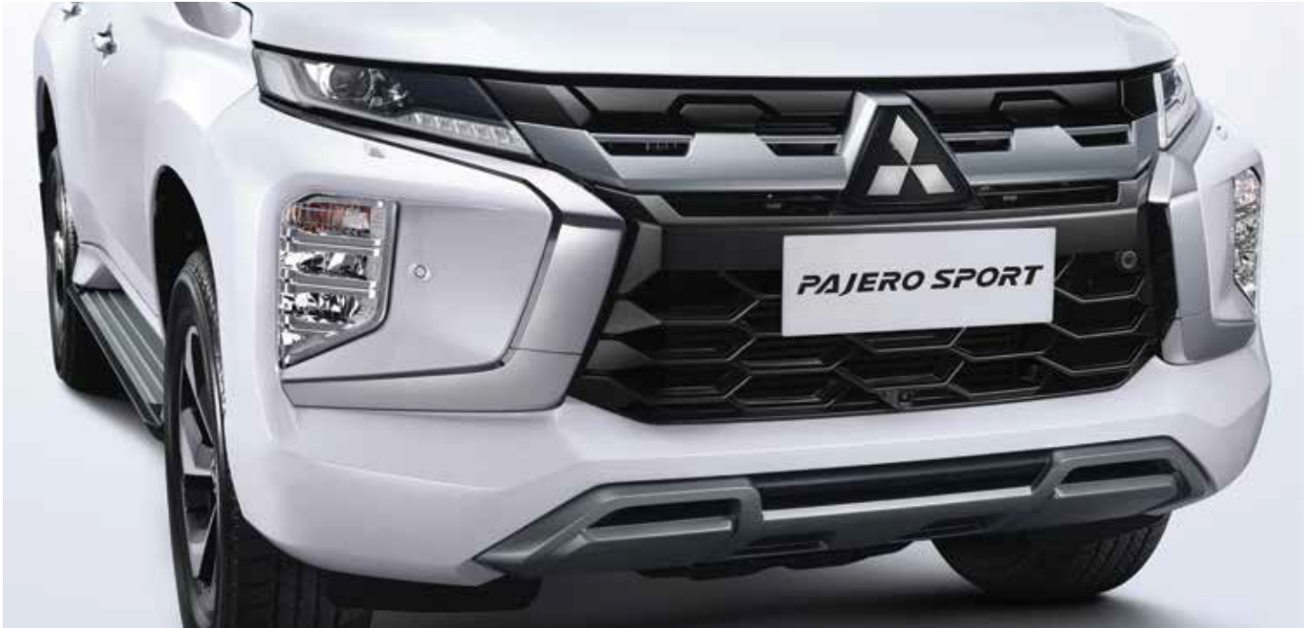
NEW FRONT GRILLE & UNDER GARNISH

Experience enhanced robustness for a bolder presence.