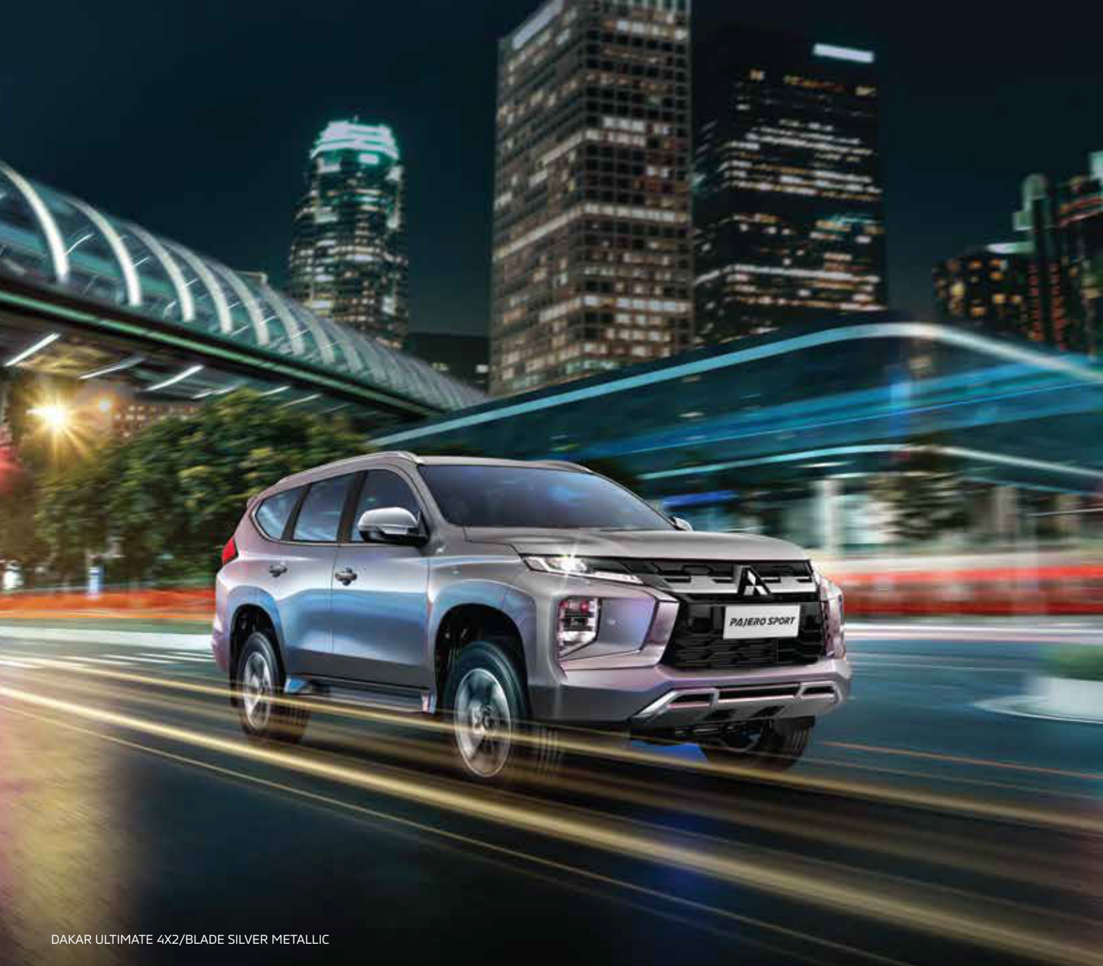
DAKAR ULTIMATE 4X2/BLADE SILVER METALLIC