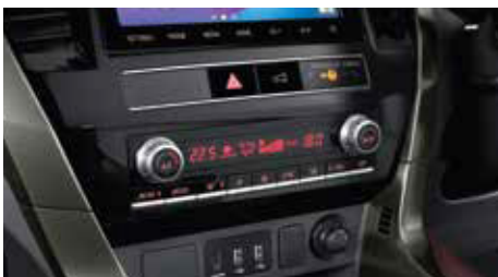
DUAL ZONE AC WITH NANOE™ X 3