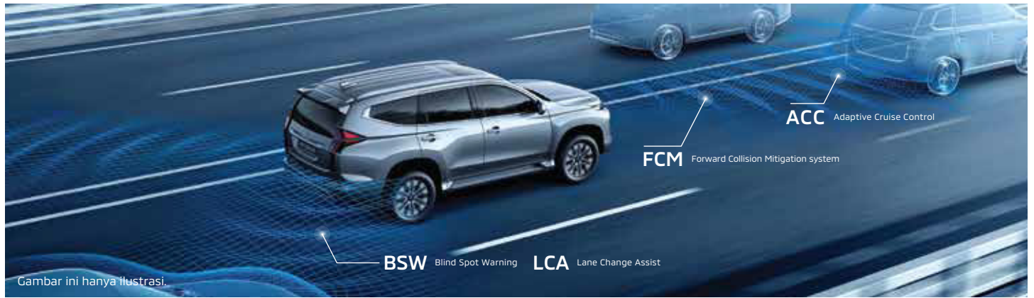
Gambar ini hanya ilustrasi.