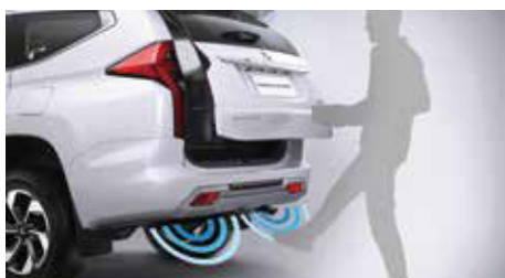
HANDSFREE POWER LIFTGATE WITH KICK SENSORS 2